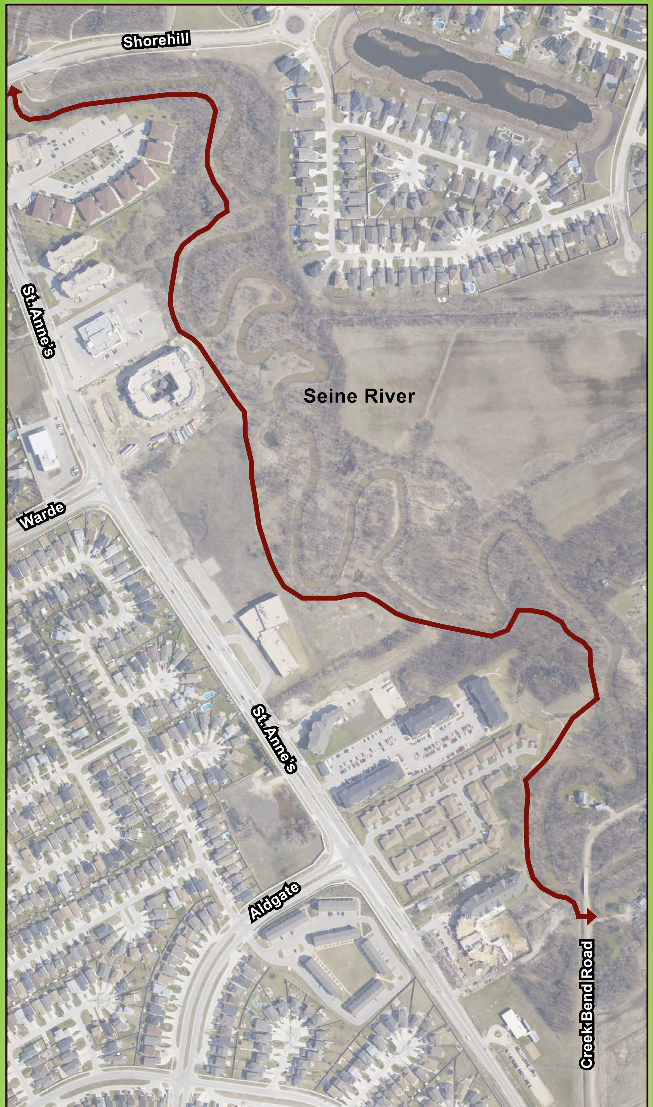
←→ Granular pathway

Trail construction will involve tree removal. The exact location of the pathway will be determined on site throughout the construction period, to help protect mature trees and other environmentally significant areas.